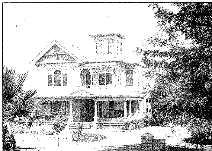
Historic photo of the B.H. Jacobs home on east Cypress Avenue.