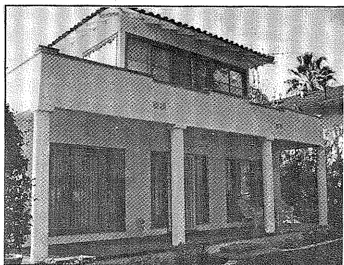
The Schmidt Home on Terracina Boulevard.