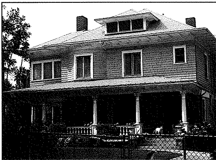
The Adair home on Center Street