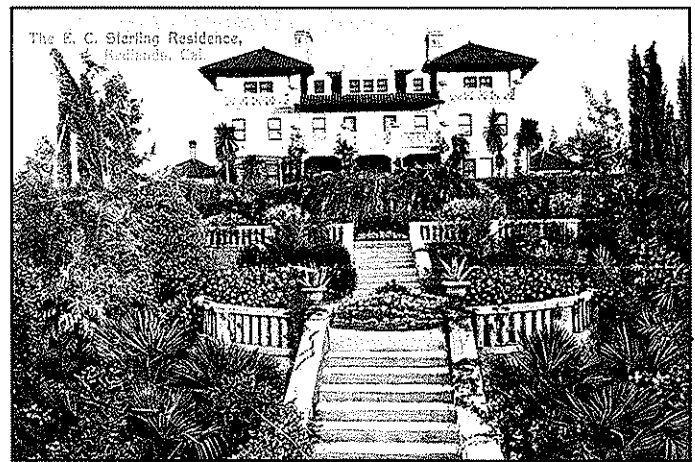
La Casada, the Sterling Residence on West Crescent Avenue