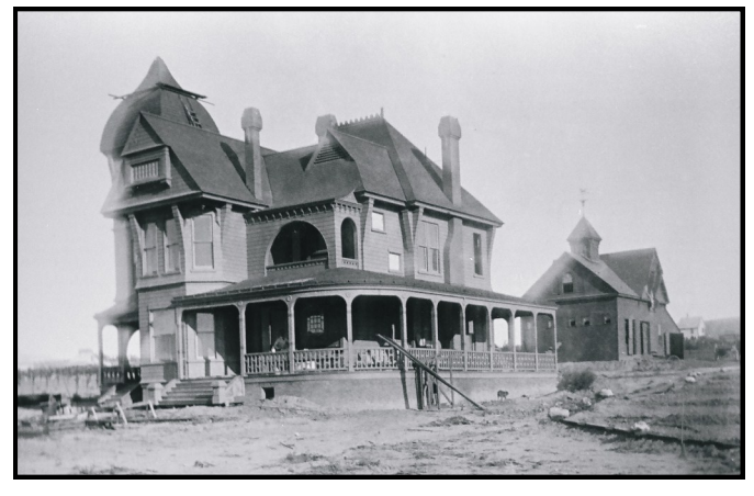
Thomas Y. England and James W. England home located at 301 West Palm was built in 1891.

In two parts February 9th and February 23rd