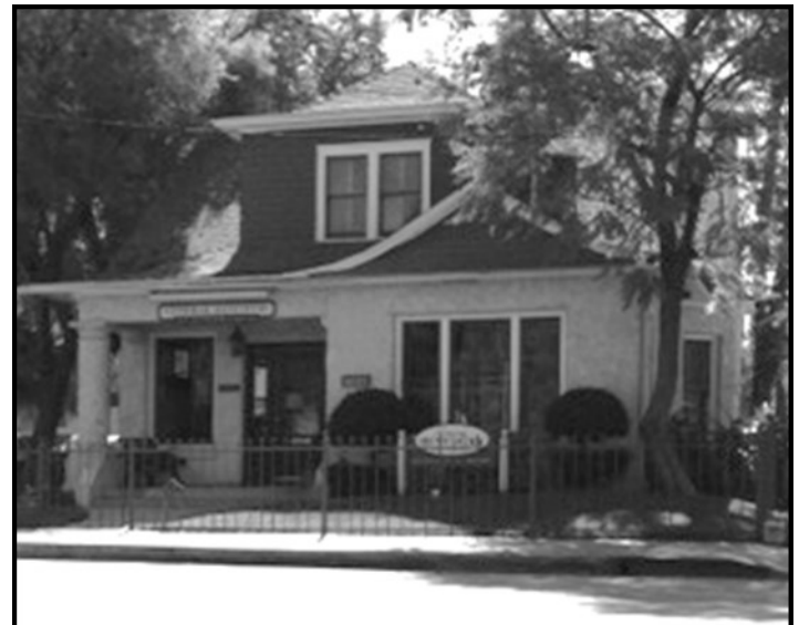
754 East Citrus Avenue