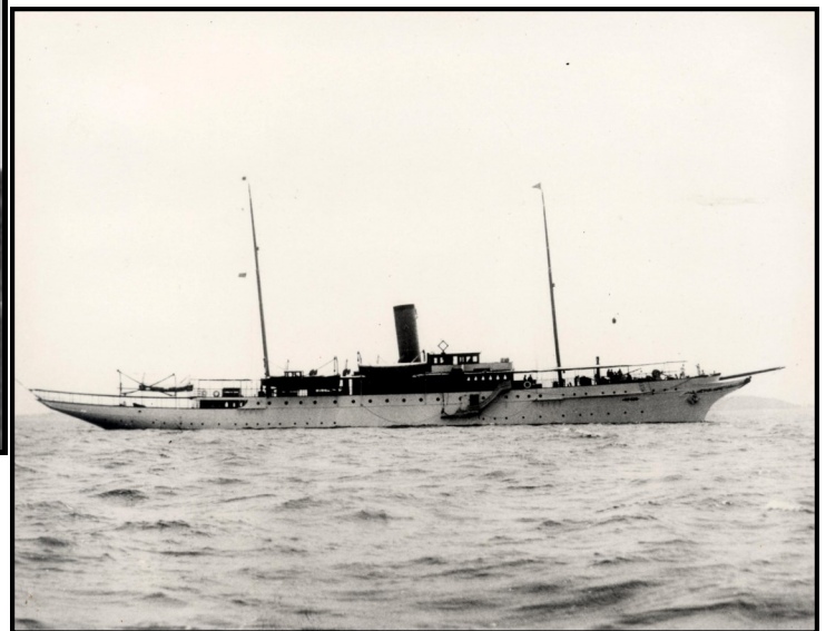
“Seahome” (left) and The Aztec (above)