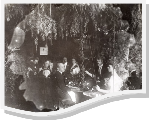
A Party at the Burrage Estate