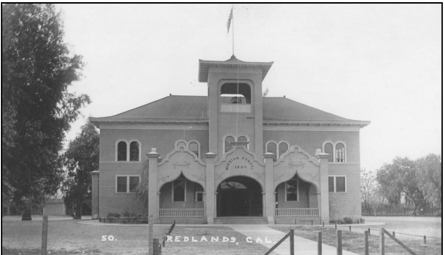
Mission School, constructed in 1904.