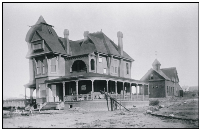
Thomas Y. England and James W. England home located at 301 West Palm was built in 1891.

In two parts February 9th and February 23rd