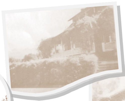
From left: Reid, Robinson & Harley houses.