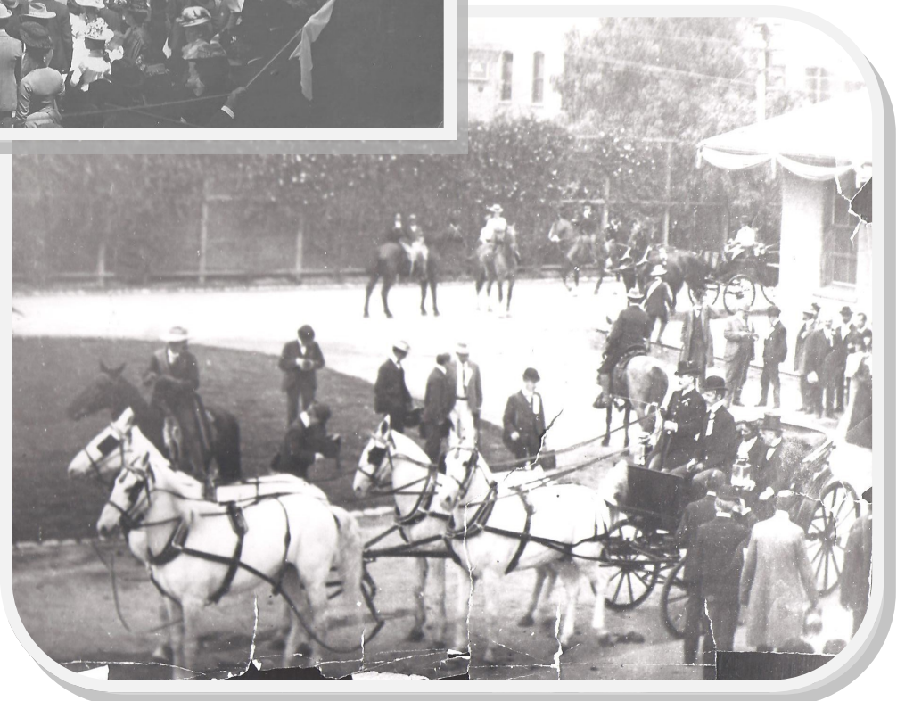
President McKinley and his wife leave the Southern Pacific depot, right.