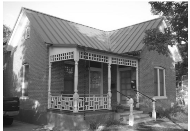
11 Grant Street