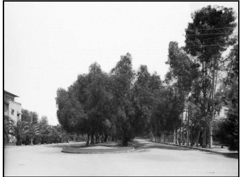
Colton Avenue with Casa Loma Hotel seen at left.