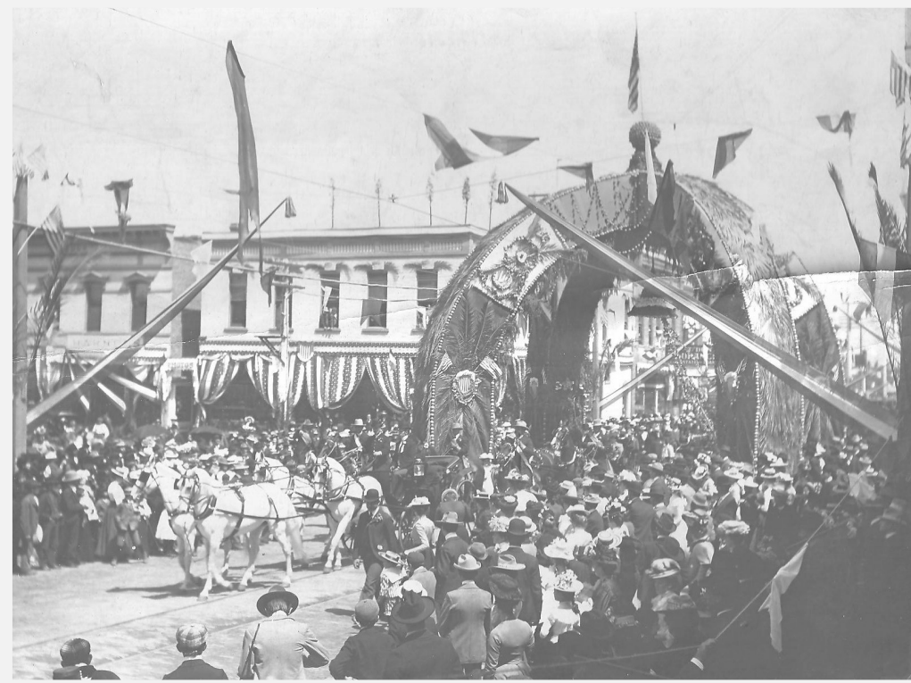
President McKinley downtown, left.

Redlands further recognized the McKinley visit with the dedication of McKinley Elementary School in 1902. The two and a half-story brick building with a tall bell tower was erected on West Olive and Center Street.