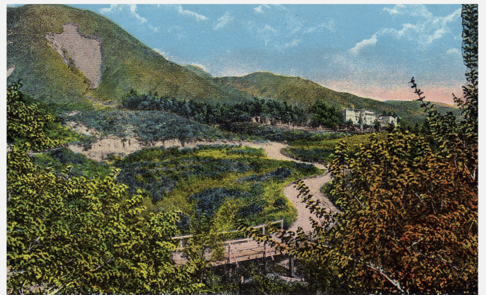
Arrowhead Mountain, near San Bernardino.