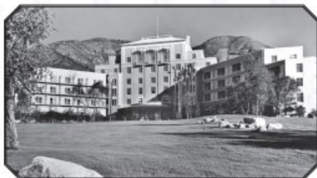
The fourth and current hotel, 1939 - present