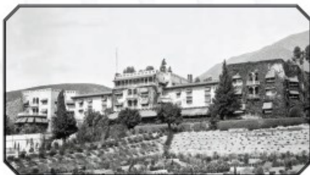
The third hotel, 1926