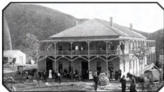
The first hotel, circa 1884