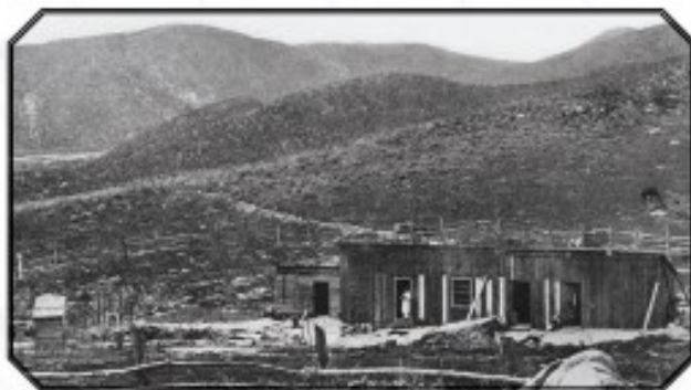
The Infirmary, circa 1864