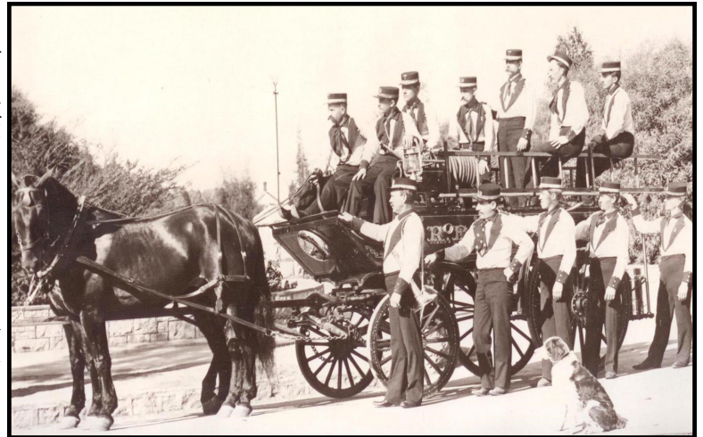
Redlands Fire Department's chemical wagon and crew of volunteers.