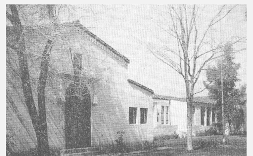
Crafton School in 1938.