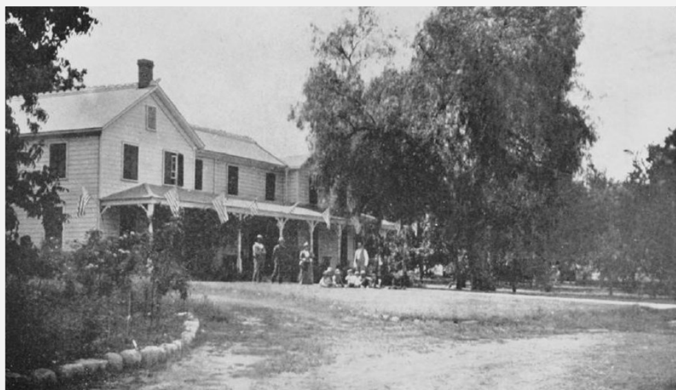
Crafts Home , "Crafton Retreat"