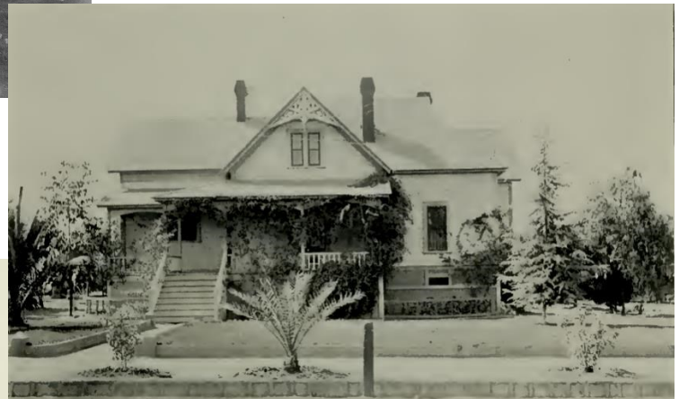
180 South Eureka Street.