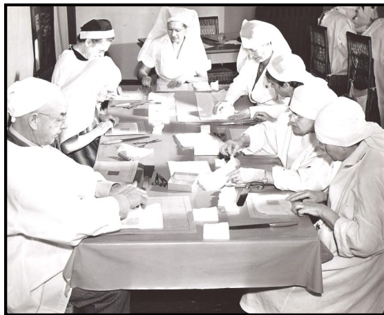
Red Cross Gauze and Bandage Volunteers.

Please join us to visit this lovely and interesting old home.