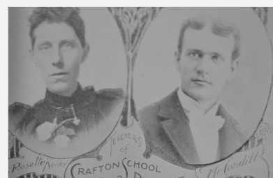
Crafton School Teachers.