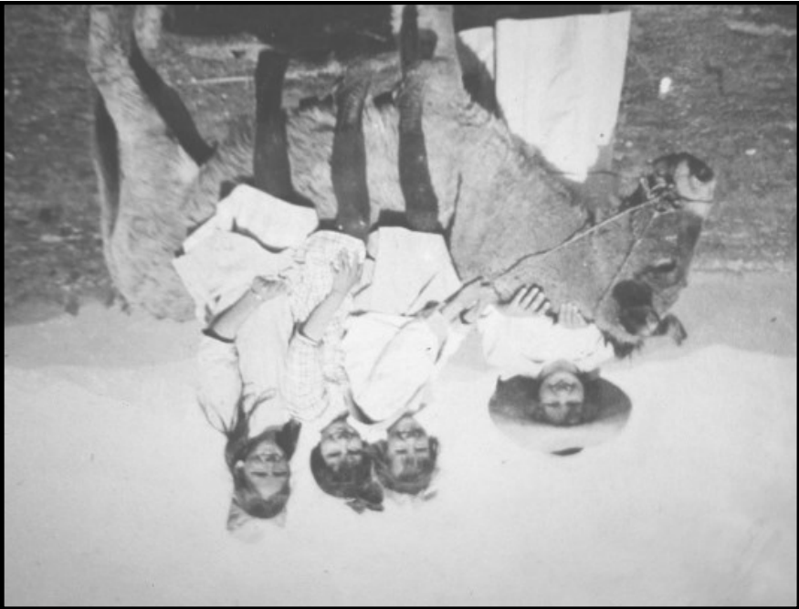
Crafton Children on a Donkey.

Visit us on the World Wide Web at www.rahs.org