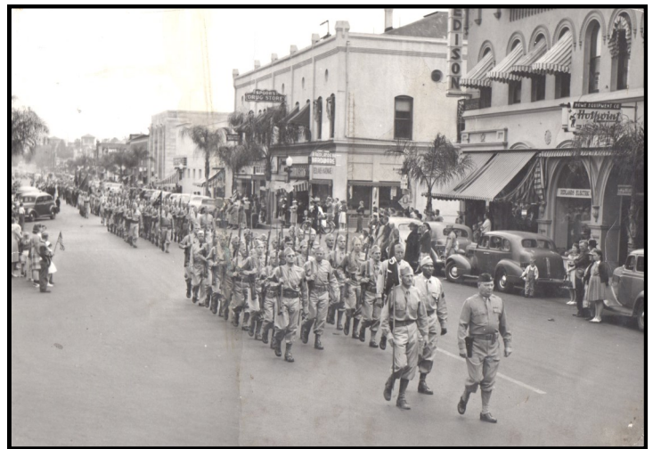
World War II Troops are led past the Fisher Building on Orange Street in 1942.