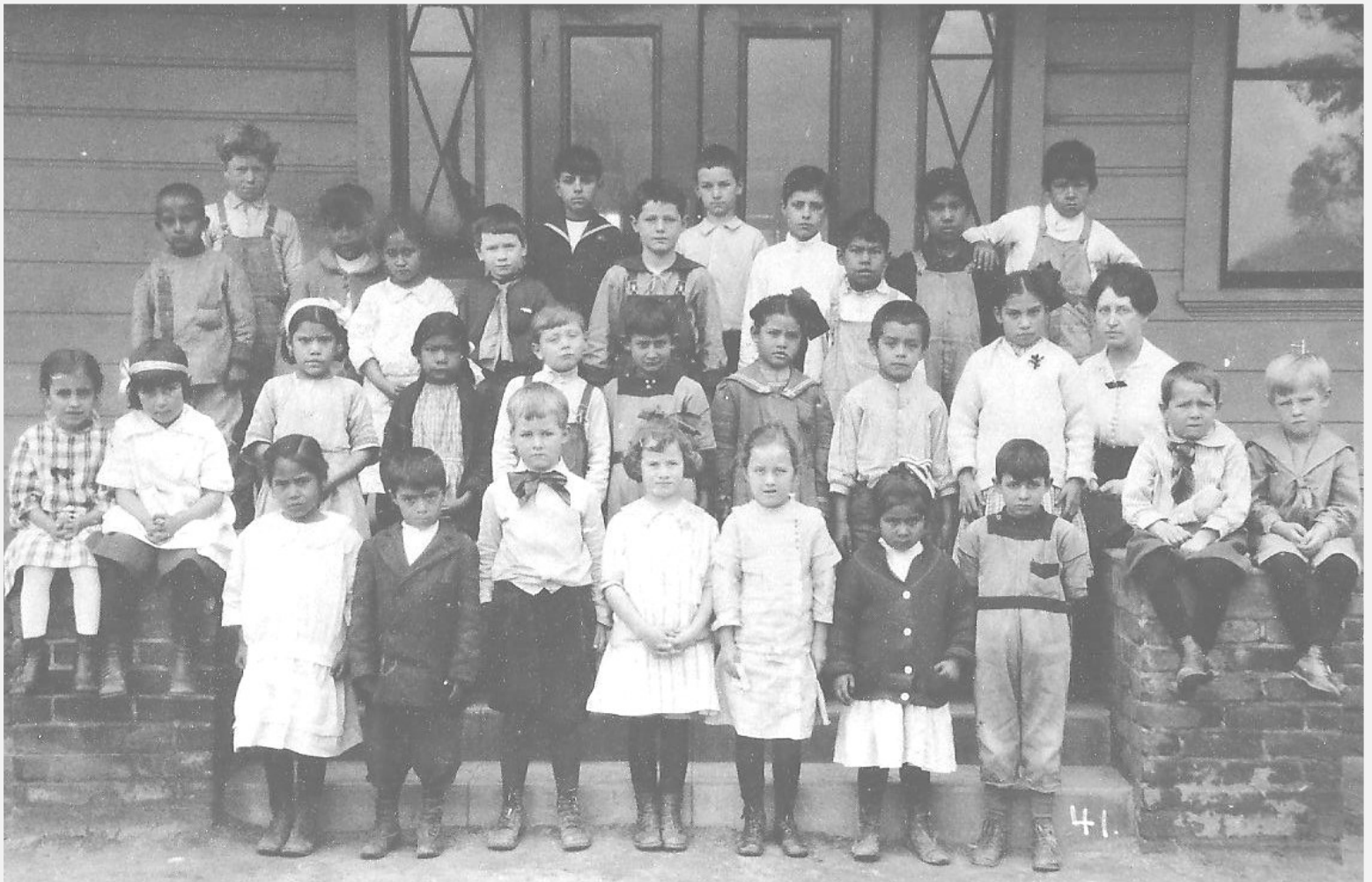
Students and their Teacher at Crafton School, 1915-1916.