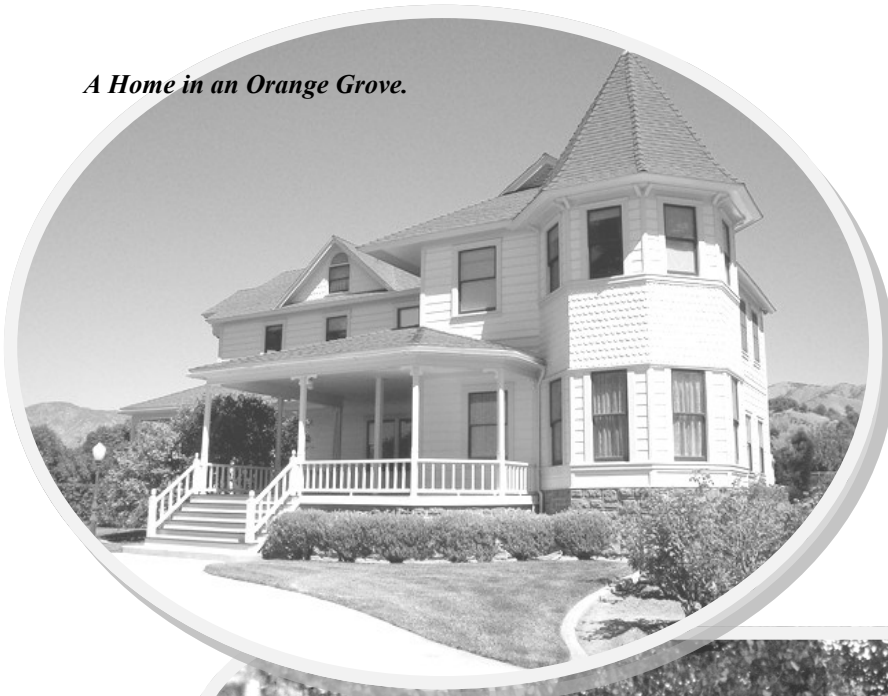
A Home in an Orange Grove.