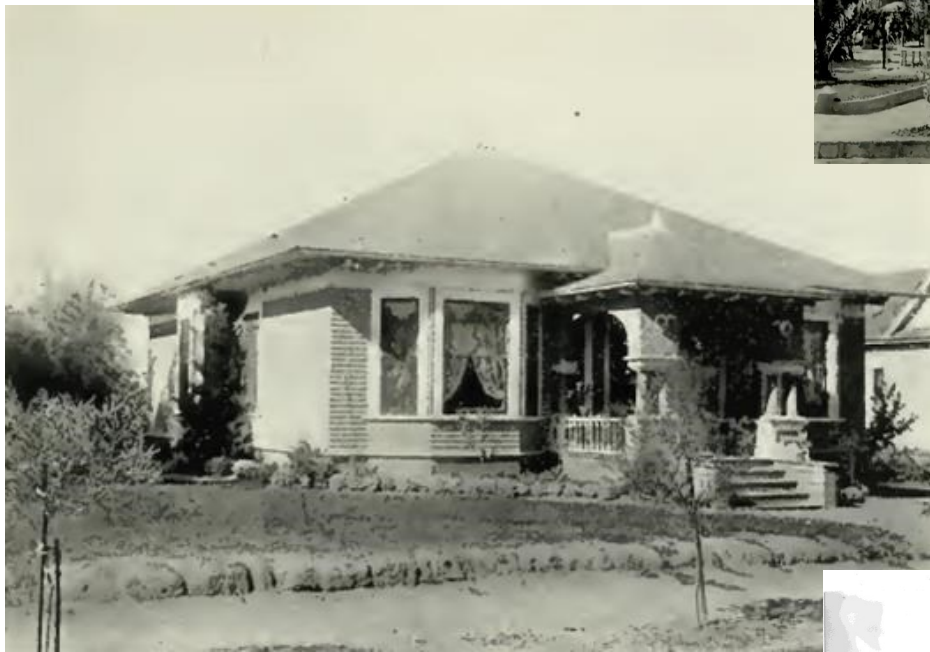
256 S. Eureka Street, above; 344 S. Eureka Street, at right.