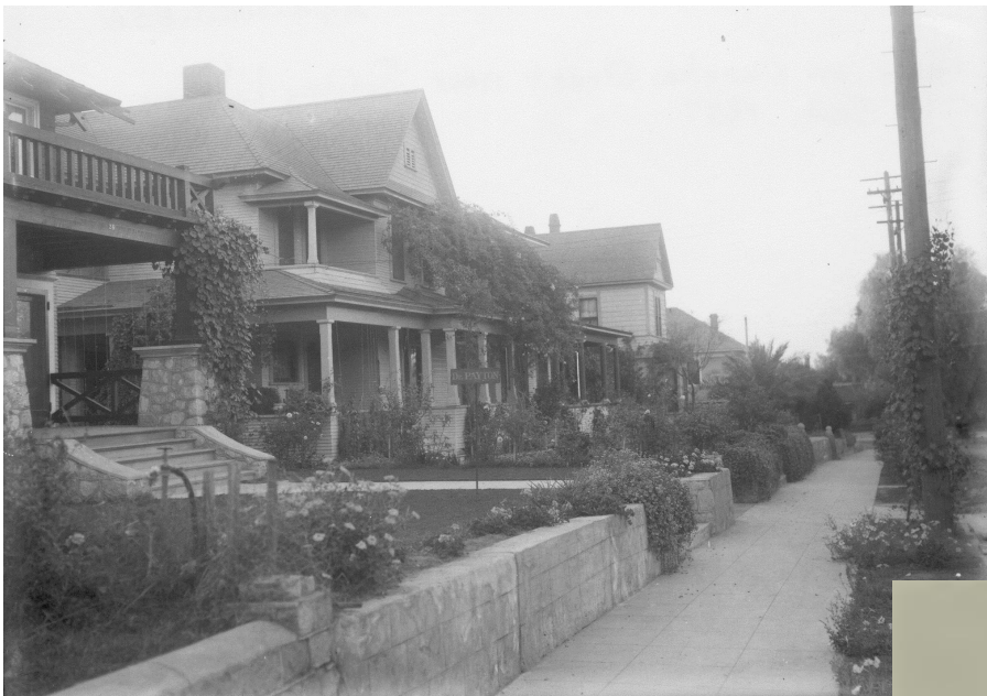
Homes South of the Post Office.