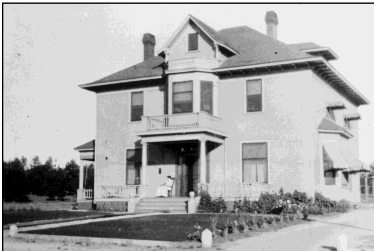
An unidentified woman sits in her rocking chair on the porch of the Cope house.