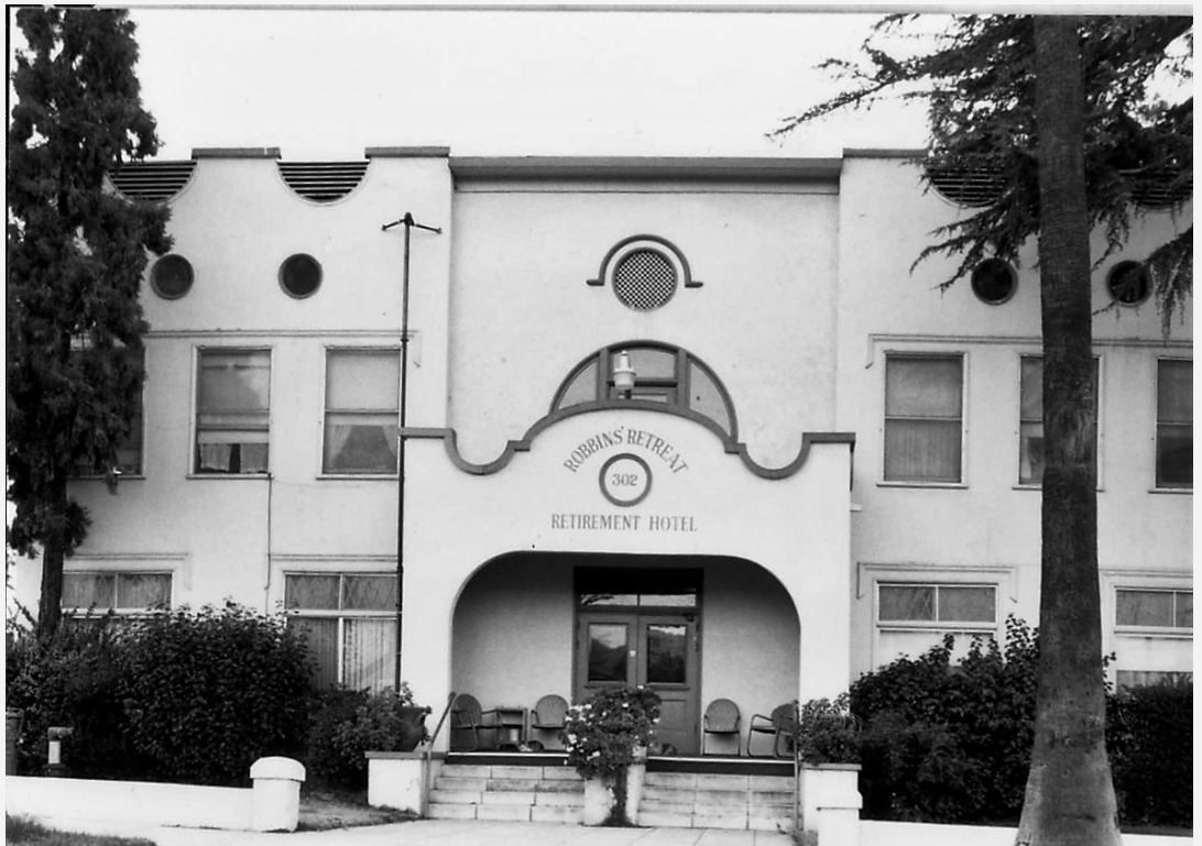
The 1904 Redlands Hospital Building on Nordina Street is shown here as Robbins Retreat Retirement Hotel.

In 1904, Redlands built a new thirty-bed hospital on Nordina. The proposed hospital raised the ire of Nordina residents, who feared a sanitarium filled with tuberculosis patients. The Redlands City Council responded by declaring Redlands a tubercular free community that would not allow TB patients rooms in the city. The Episcopal Church created The Settlement below Hillside Cemetery to accommodate tubercular patients medical care and tent cabins. §