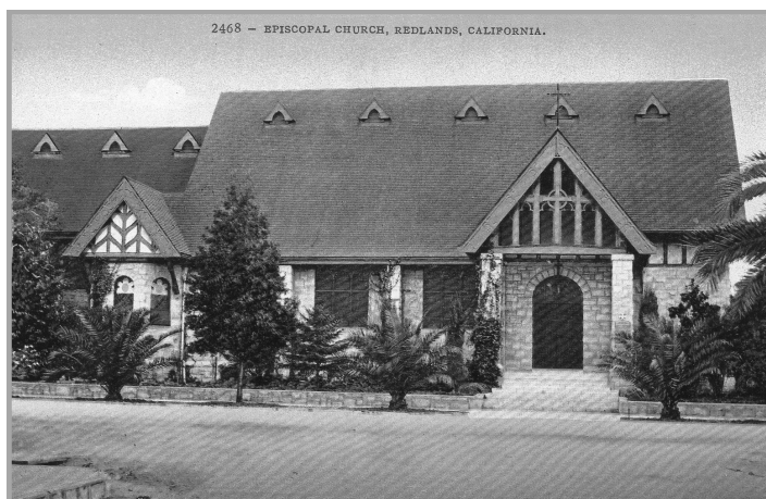
2468 - EPISCOPAL CHURCH, REDLANDS, CALIFORNIA.