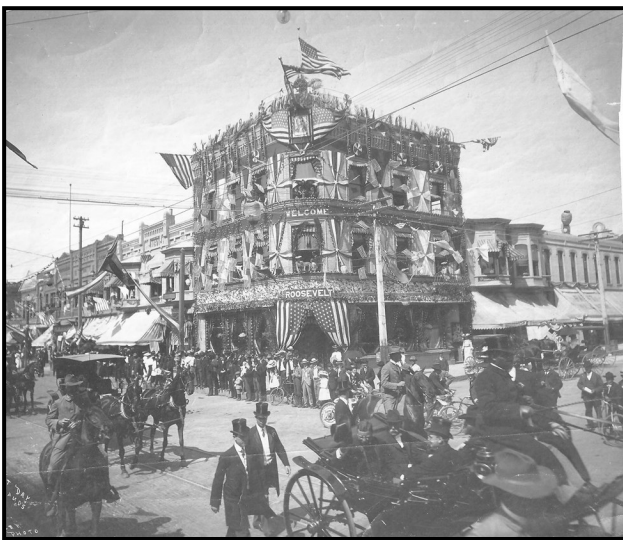
President Roosevelt's carriage passes Union Bank at the corner of Orange & State.