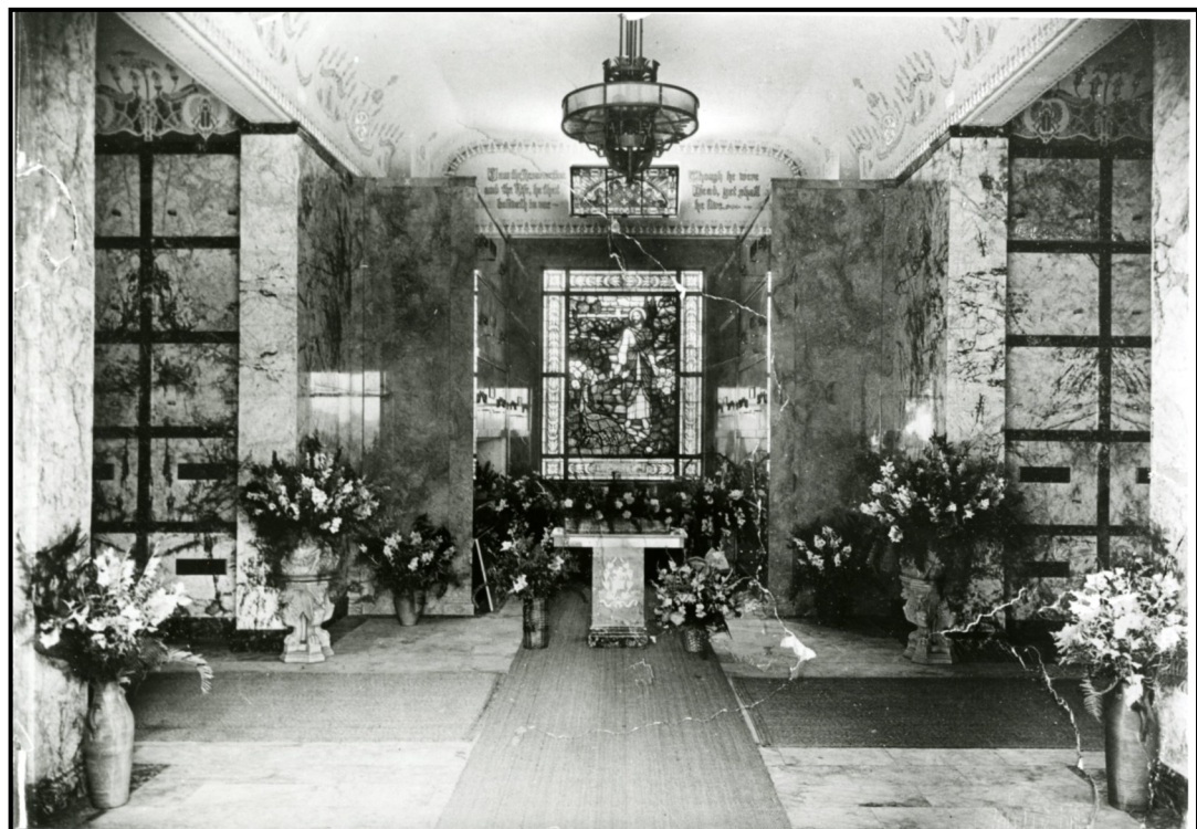
Interior view of the cemetery's Egyptian Mausoleum, built in 1928.