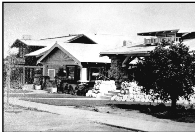
500 block of Eureka Street.