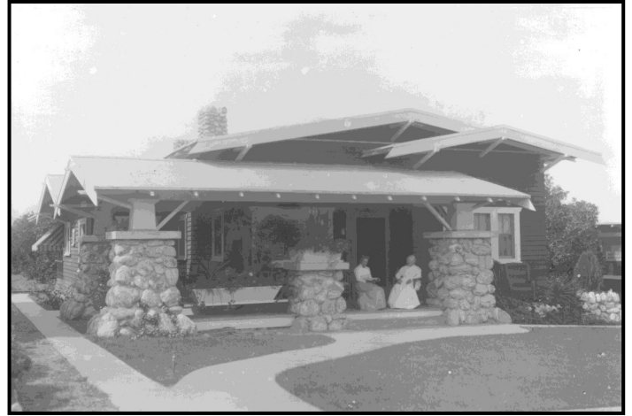
510 Eureka Street.

Historical Society monthly programs are open and free for the public to attend.